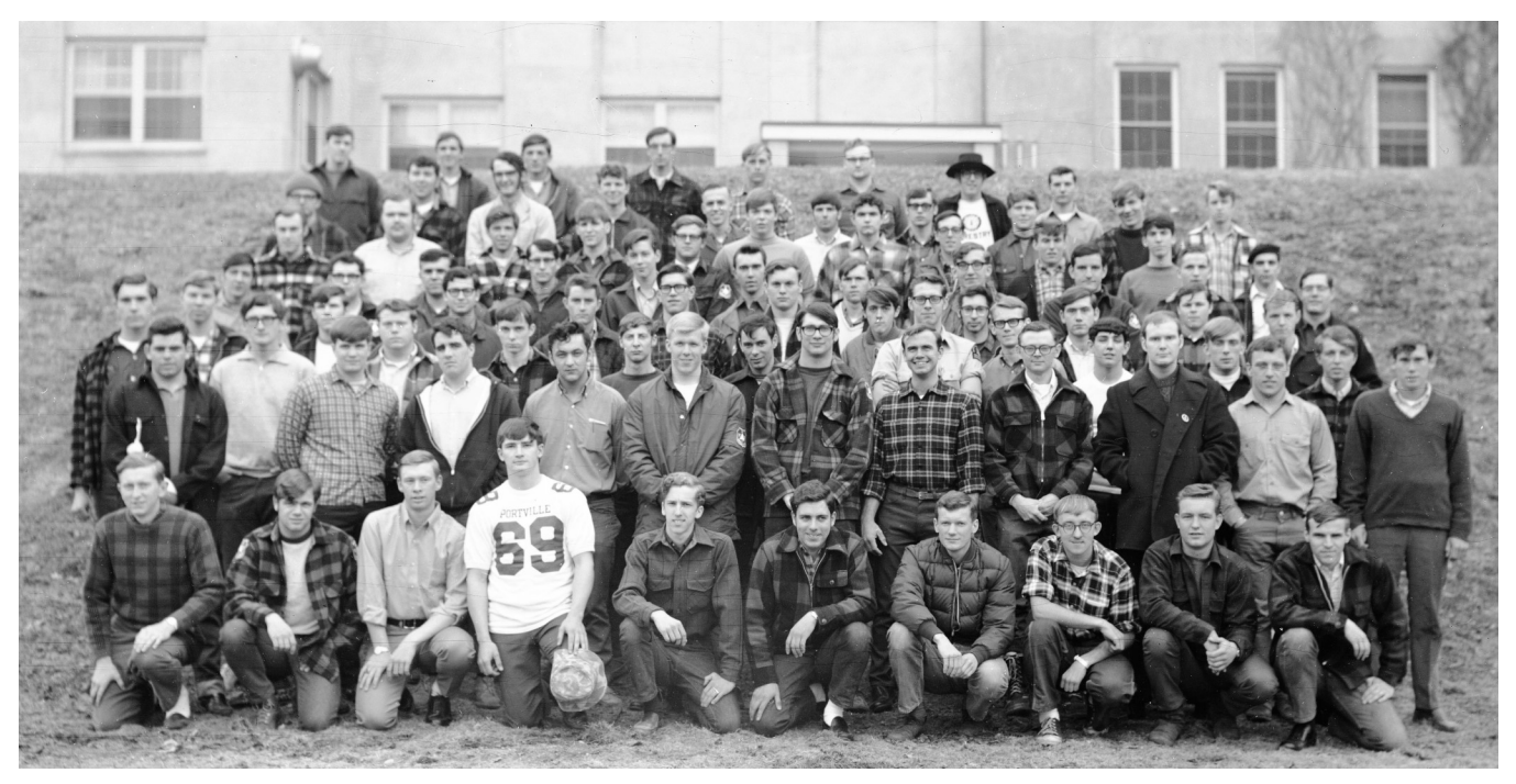
The Class of 1970—First Day

Class of 2020 – Celebrating their very first reunion and recent graduation!